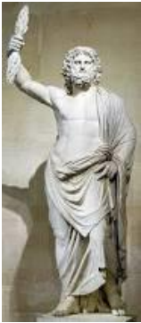
JUPITER ( ZEUS)

IN ROME the people had a polytheistic religion coming from the greek culture like other many things inside rome's culture. but to differentiate the romans changed the names of the greek gods,example: