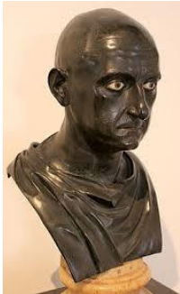
Pulus Cornelius Scipio

ROME had many important politicians and war leaders (some were bad and other good) .